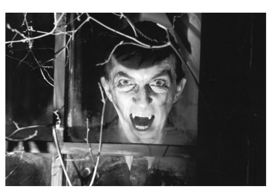
Jonathan Frid as vampire Barnabas Collins in ABC's "Dark Shadows."

Tales of blood-sucking demons date to biblical times at least, but the vampires we know and love arose from the mists of Eastern European folklore centuries ago, perhaps as a response to Hapsburg occupation, only to find themselves celebrities in the early 18th century.