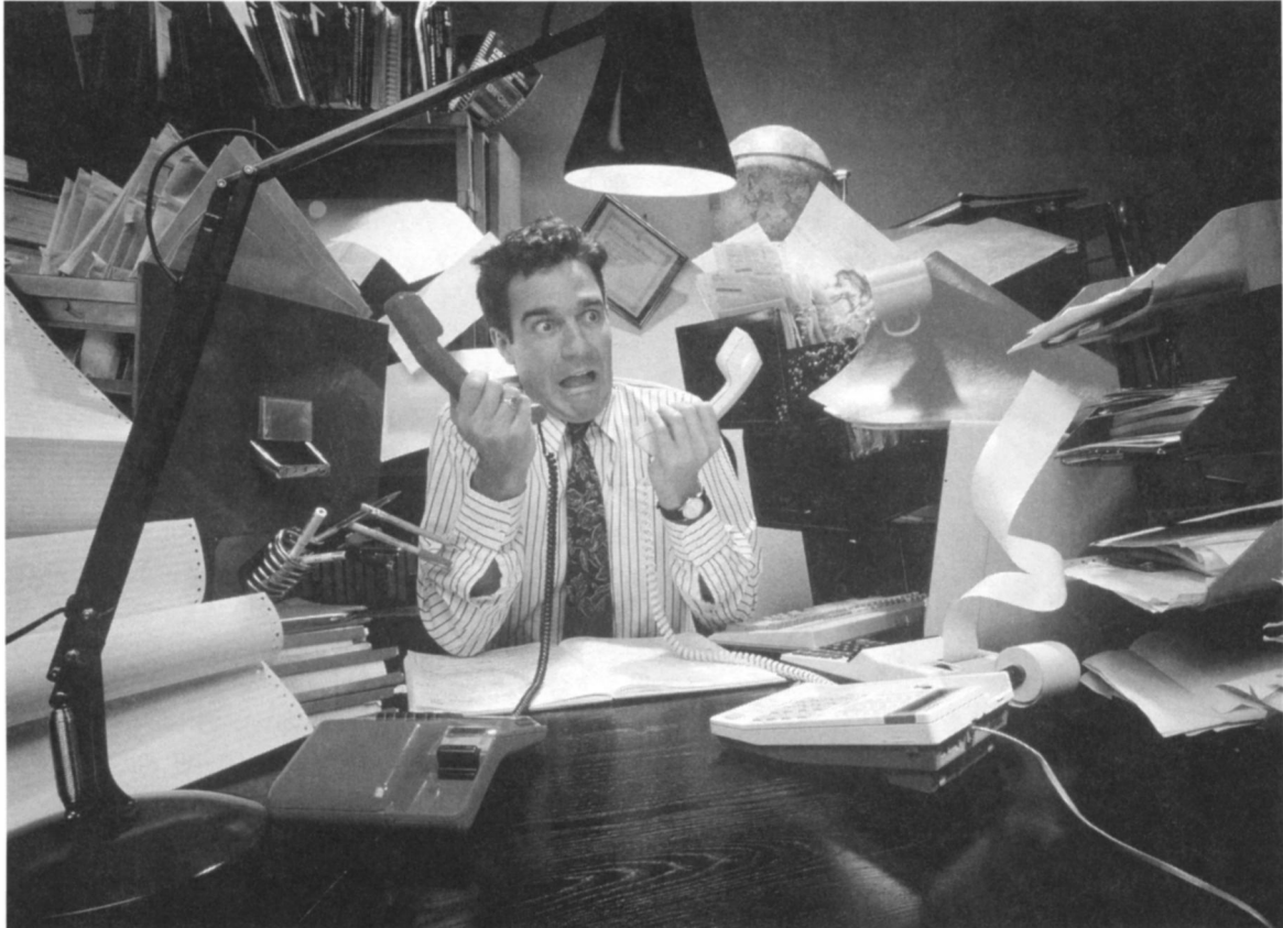
Faster! While Americans complain of job stress, only a fraction of the population is working harder. Most Americans have more leisure time than ever.

ties business—these developments and so many others have helped foster a vastly more competitive commercial environment than existed a generation ago, an era well within living memory for many American workers, who recall a time when U.S. industrial might was unchallenged.